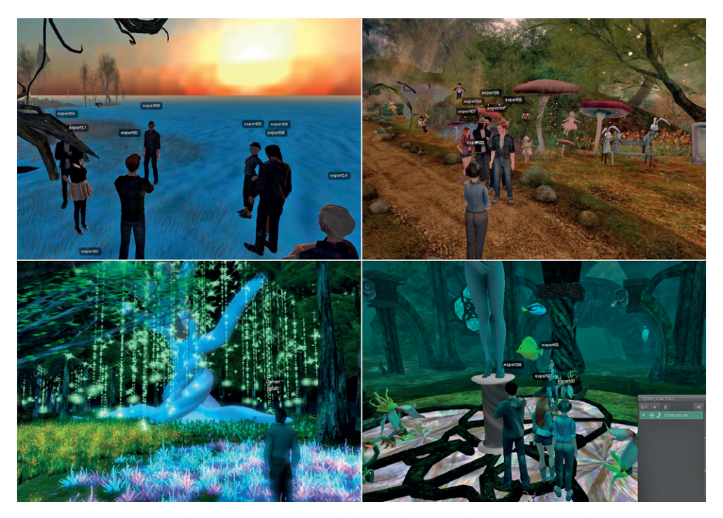
Figure 1. Screenshots of the virtual places used during the workshop and avatars of the participants

The participants were then installed in 3 computer rooms in groups of 6 to 7 participants in order to experience themselves teamwork in virtual environment (avatar manipulation,